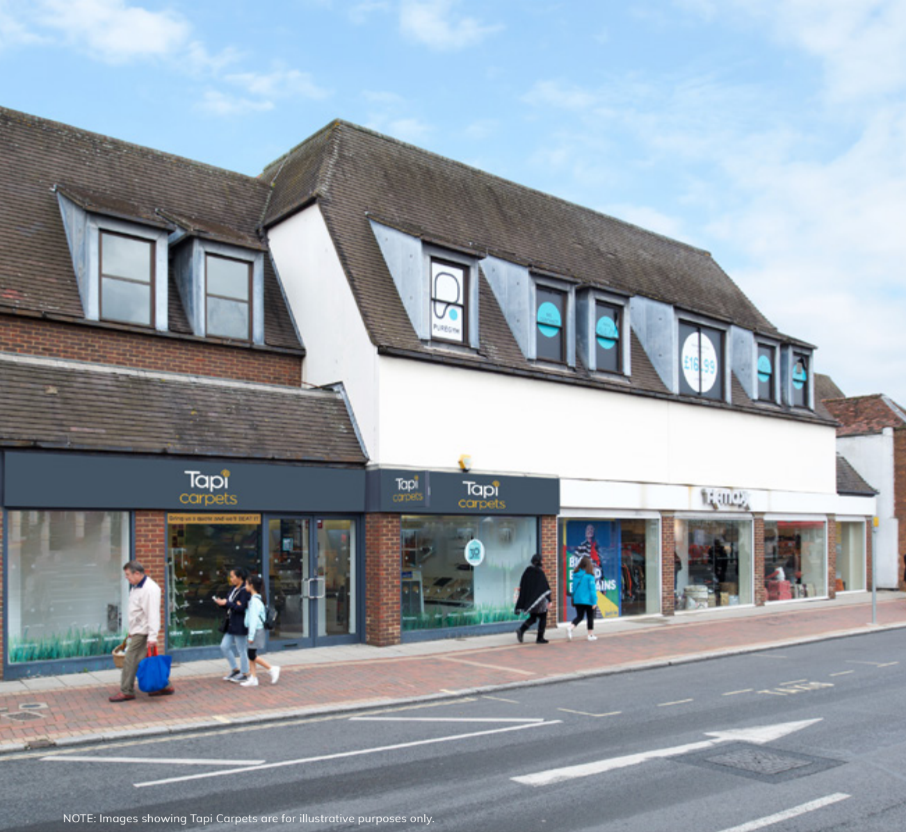
NOTE: Images showing Tapi Carpets are for illustrative purposes only.