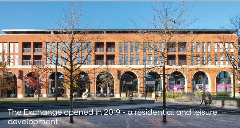
The Exchange opened in 2019 - a residential and leisure development