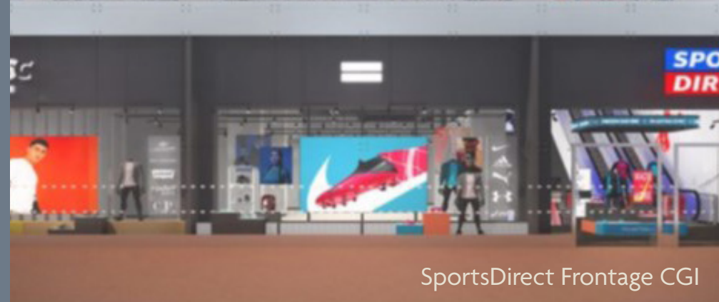
SportsDirect Frontage CGI