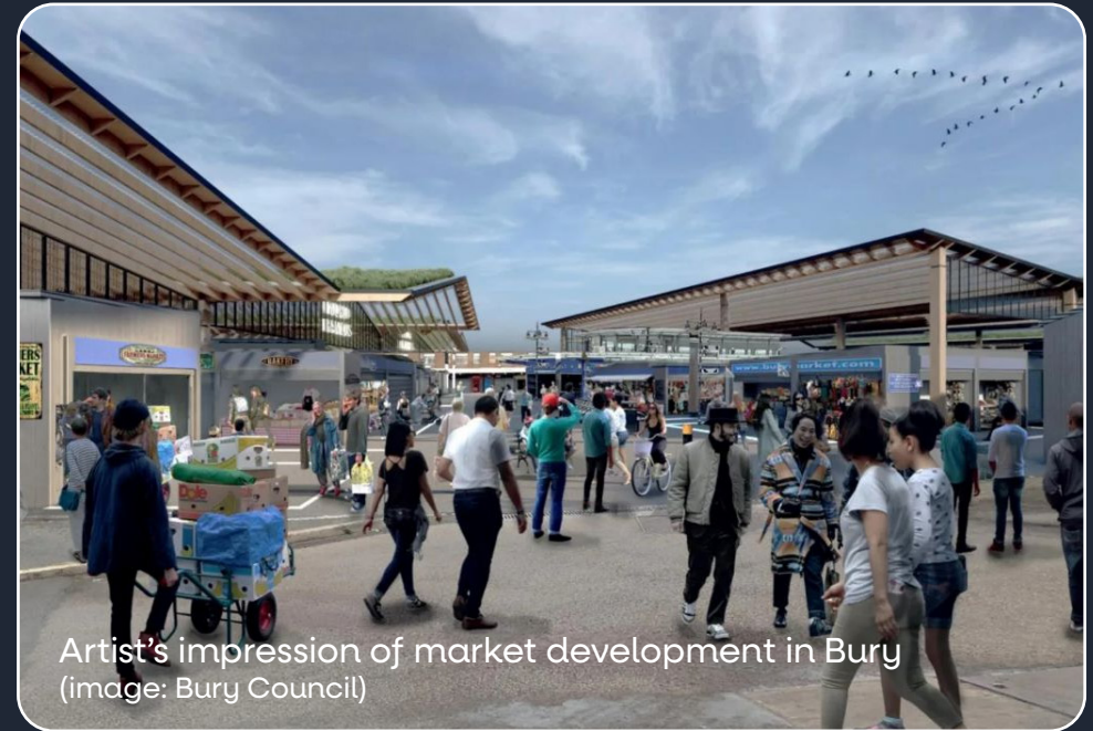
Artist's impression of market development in Bury (image: Bury Council)

£20 million Levelling Up Fund was granted to Bury in January 2023.