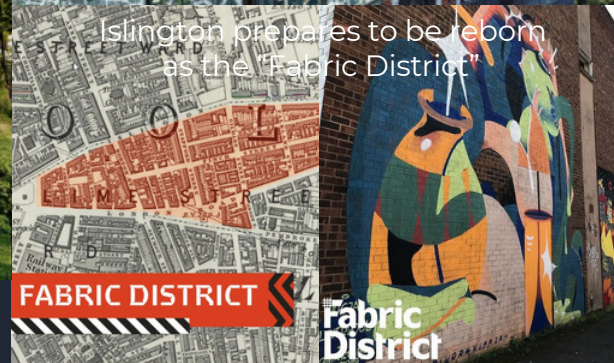
Islington prepares to be reborn as the "Fabric District"