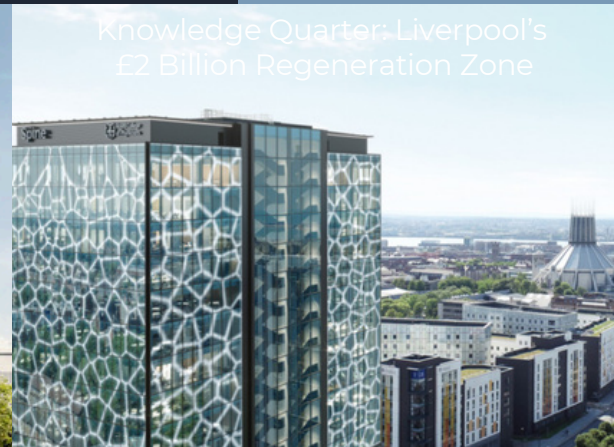
Knowledge Quarter: Liverpool's £2 Billion Regeneration Zone