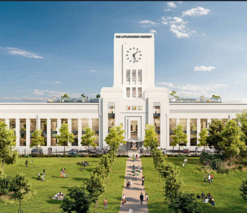
Littlewoods Film Studios 750,000 sq ft scheme

... the riverside Liverpool Waters regeneration, the funky Fabric District, Paddington Village “Knowledge Quarter”, Pall Mall office district and the mega new film studios in the Littlewoods building.