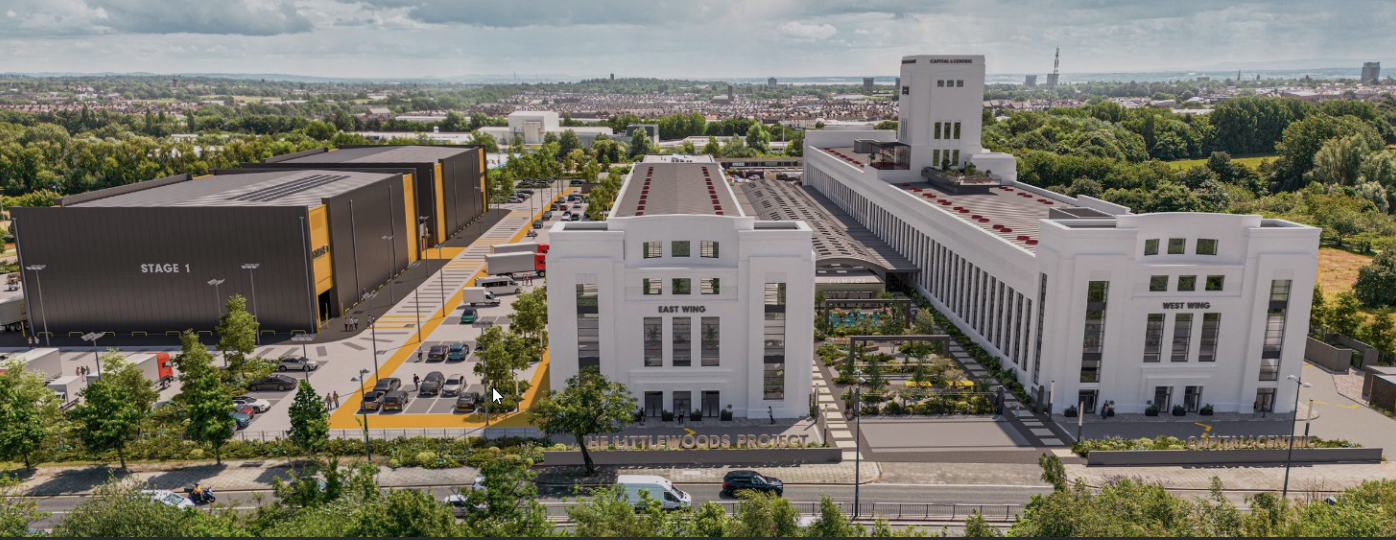
The Littlewoods Project £70 million - construction starts 2024