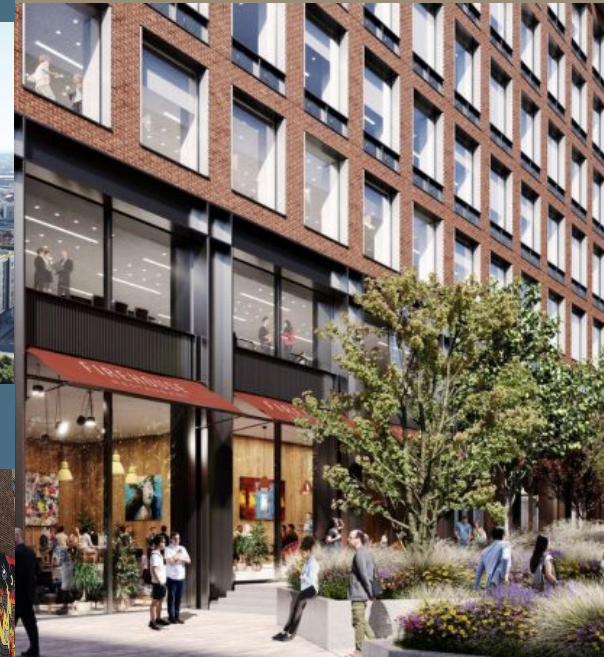
Pall Mall - office district redevelopment