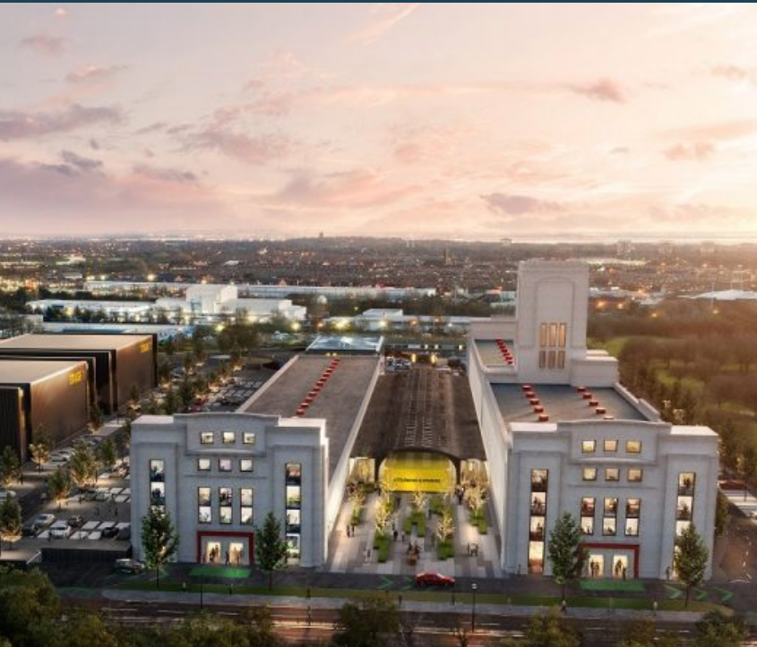
Littlewoods Film Studios 750,000 sq ft scheme

... the riverside Liverpool Waters regeneration, the funky Fabric District, Paddington Village "Knowledge Quarter", Pall Mall office district and the mega new film studios in the Littlewoods building.