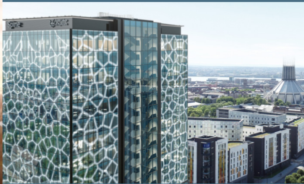
Islington prepares to be reborn as the "Fabric District"