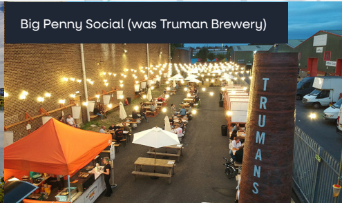
Big Penny Social (was Truman Brewery)