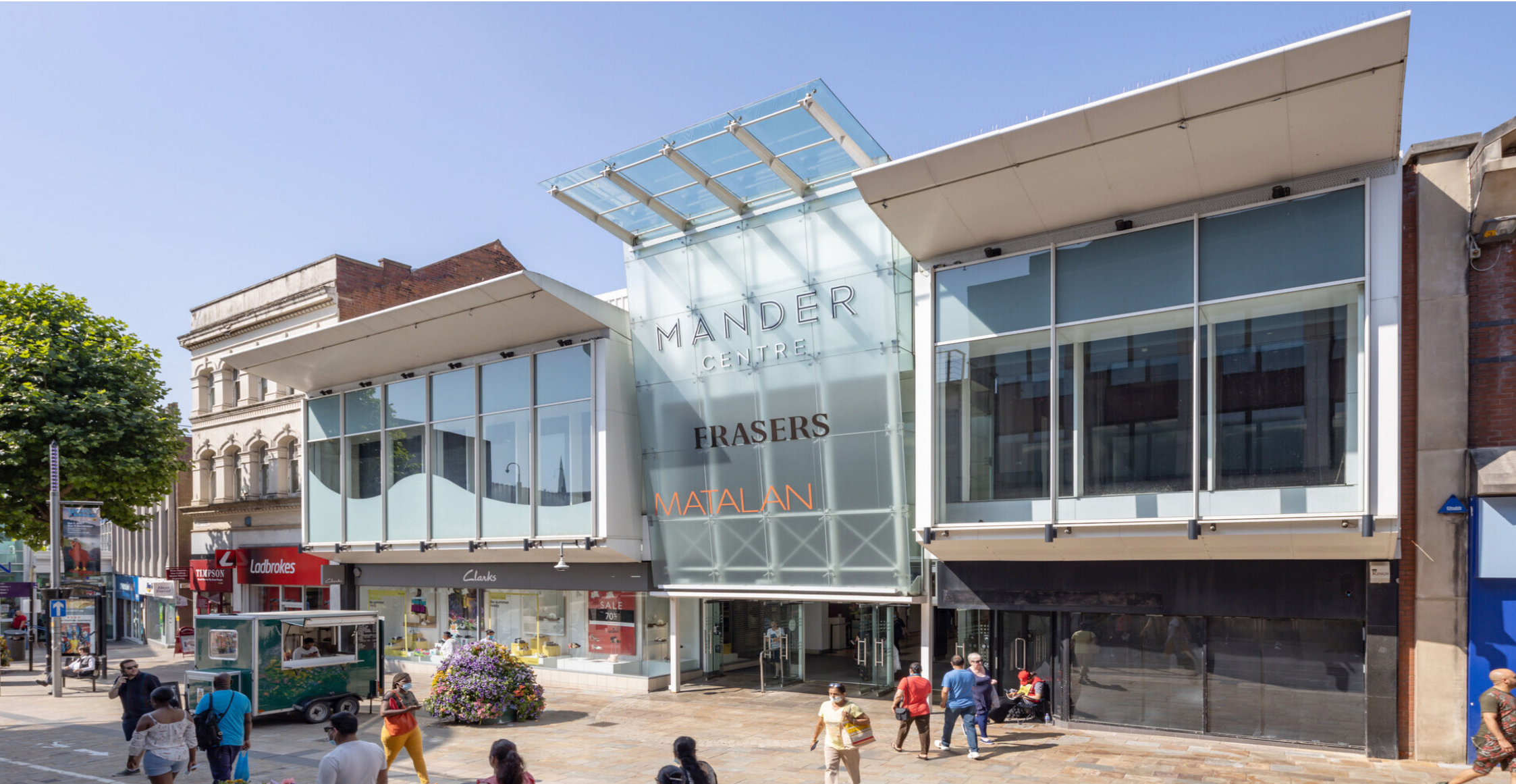
MANDER CENTRE, WOLVERHAMPTON